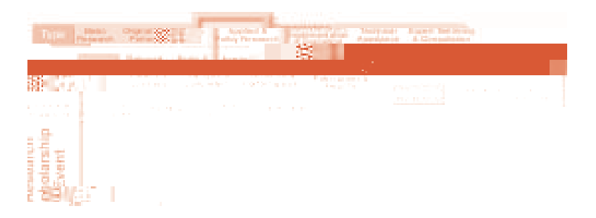
Figure 3. UniSCOPE Model of Research Scholarship

The "mix and match" features of the UniSCOPE model are also apparent here. For example, the results of basic research can be published in refereed journals for colleagues and professionals. That same information can also be used for creating applications through grants and contracts for corporations, communities, or government agencies. Many other combinations are also possible. We believe this model has the essential concepts for developing a comprehensive, fair, and equitable approach to recognizing and rewarding the full range of research scholarship.