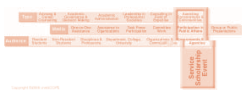
Figure 4. UniSCOPE Model of Service Scholarship

The types of service scholarship may be manifest in student advising, academic governance and decision making, academic administration, leadership in professional societies, assisting corporations and communities, and consulting based on the scholarly expertise of the faculty member. We consider the types of service scholarship to include advising, academic governance and administration, leadership in professional associations and societies,